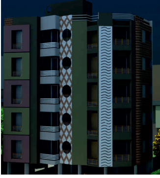
Madhupuri Apartment Vishvakunj Cross Road