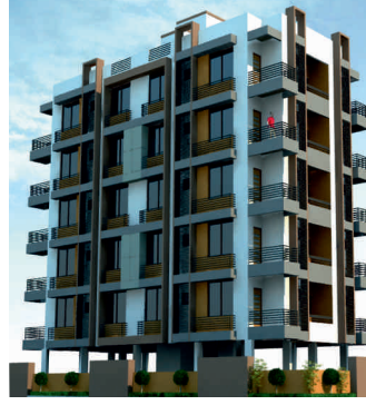
Natashwar Apartment Paldi