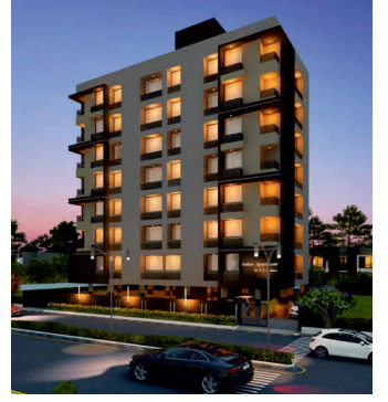
Ankur Apartment Anjali Cross Road