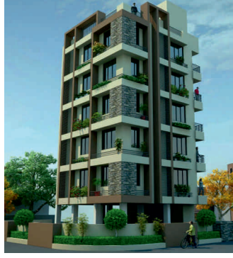
Madhupuri Residency Bhattha