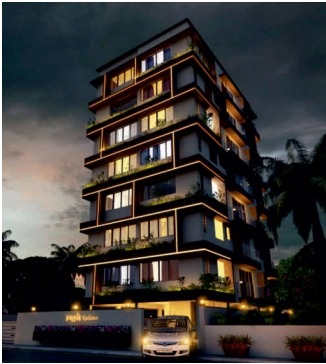
Madhupuri Radiance Mahalaxmi 5 Rasta