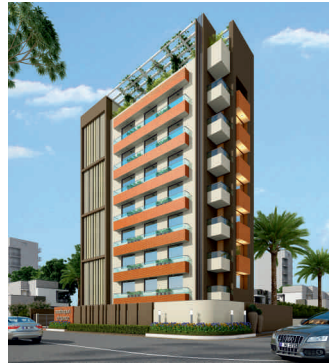
Madhupuri Elegance Maninagar