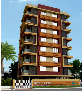
Nilesh Apartment Chandranagar